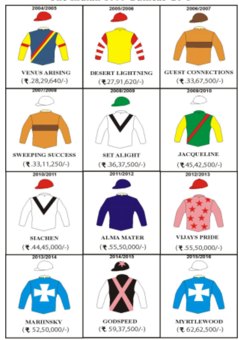
(): Total Stakes