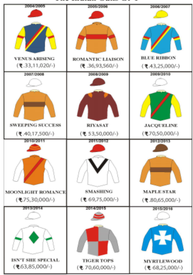
(): Total Stakes