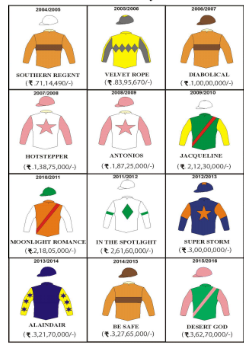
(): Total Stakes